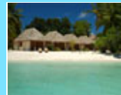
Beach Cottage Exterior