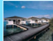
View from a Room